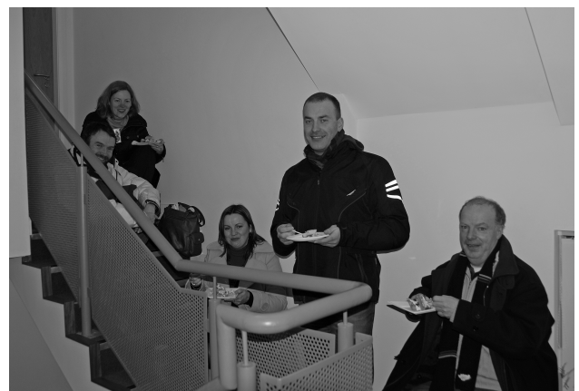
"No room at the inn": Some members of the newly formed Drama group, the St Genesius Company, form part of the overflow at the reception following the Mass.